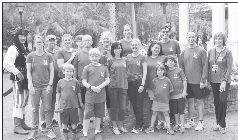
Attendees loved the camaraderie of the Grand Pediatric Pentathlon activities, shown here at the one-mile Fun Walk/Run on Friday.