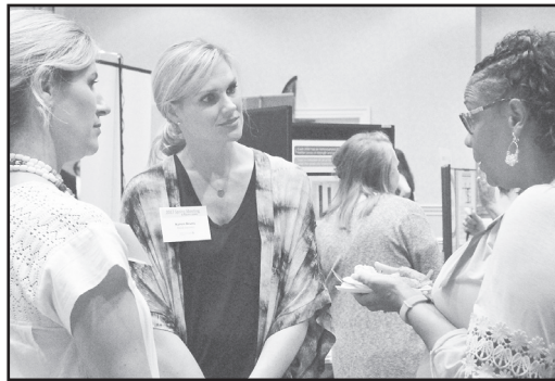
Exhibitors help support our meeting, and this year, the exhibit hall was once again a festive mix of networking, information and door prizes!