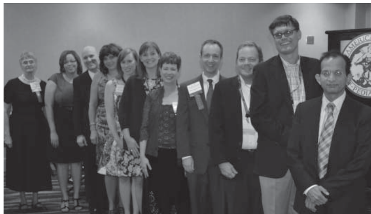
Chapter EMA Founding members are recognized at the Annual Meeting Awards Dinner in September.