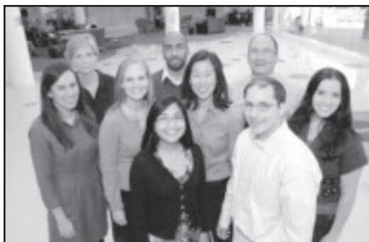
Children's of Alabama's General Inpatient Team:

The next step will be to provide each inpatient attending with information regarding his or her completion rate in comparison to our goal. We hope this knowledge itself will provide motivation to strive for improvement of completion and promptness of discharge letters. The impact of knowing completion rates has already had a positive impact on my own practice, as I am now much more attentive about making sure letters are completed for my patients after seeing how I compare to our goal. We hope that by combining electronic documentation, increasing expectations, and empowering attending physicians, we can continue to improve the discharge communication process that is essential to the continuation of care of each patient admitted to Children's of Alabama.