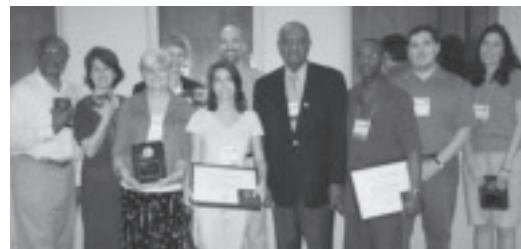
The Chapter Executive Board and other awardees gather at the Saturday awards luncheon.