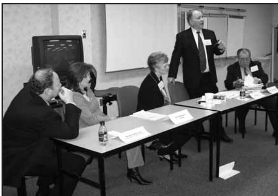
A panel discussion on access to mental health services got to the heart of the day's discussions.

The next issue of the newsletter will outline the specifics of the white paper, but the general topic areas will include: reimbursement of primary care providers for mental health services and mental health parity; education of primary care providers on mental health issues; mental health professional shortages, particularly in the rural areas; and other general mental health service access issues. The white paper will serve as a blueprint for the committee's continued work on these issues.